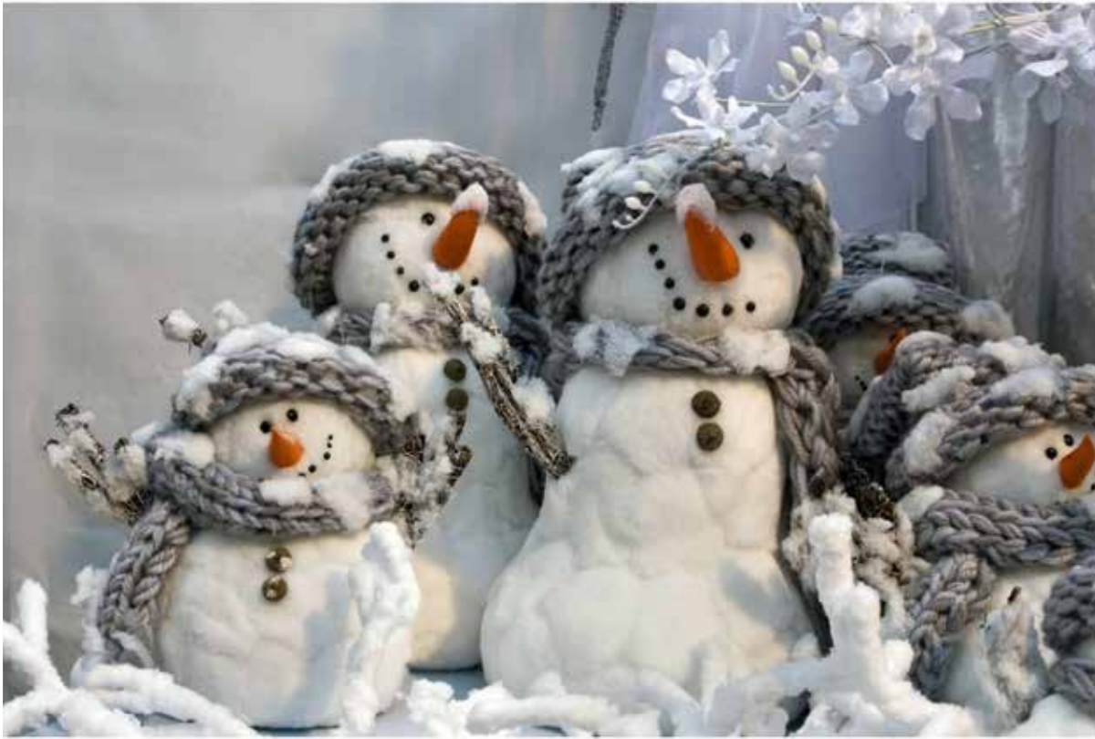
Merry Christmas and Happy New Year WV Pioneer Travelers #200