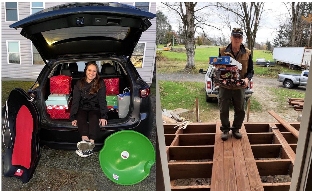
Mass One Ch 9 Social 1/9/22