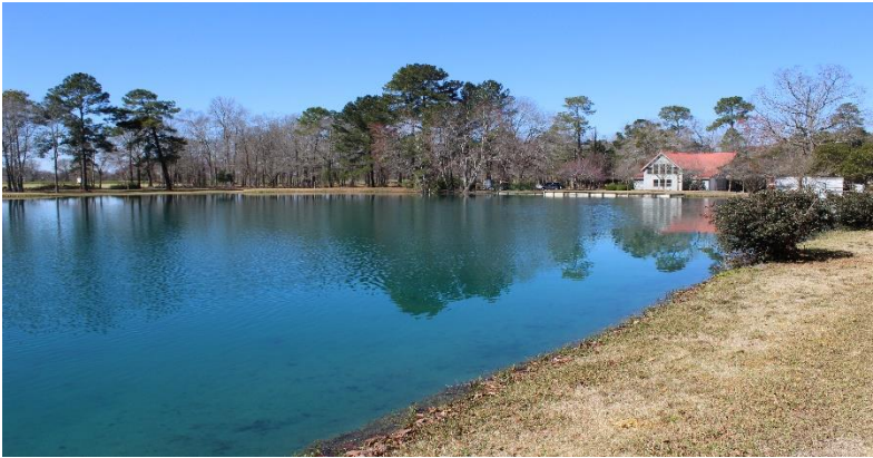
Brickyard Plantation Golf Club and RV Park